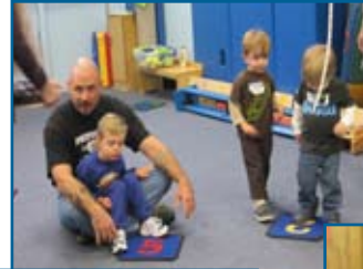
"Daddy & Me"