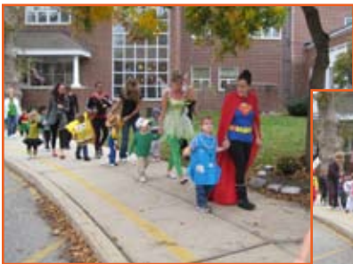
Children celebrate Halloween with a costume parade!